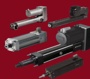
ELECTRIC ROD ACTUATORS