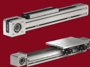
BELT DRIVE ACTUATORS